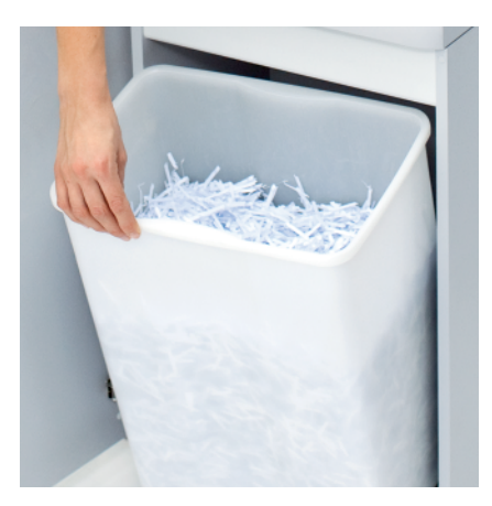
ENVIRONMENTALLY FRIENDLY BIN Durable, lightweight shred bins can be used with or without disposable bags.