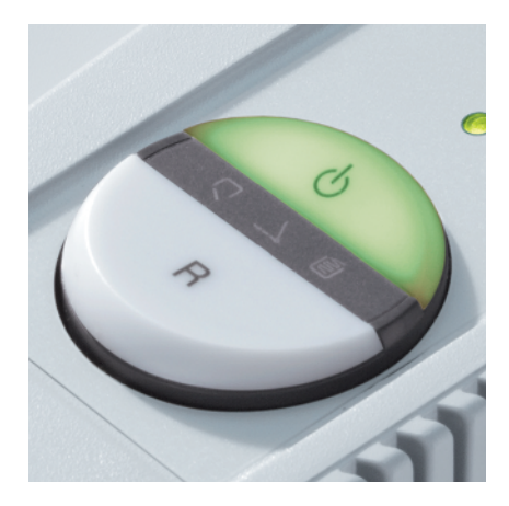
EASY SWITCH Multifunction control element uses optical signals to indicate operational status and functions as an emergency stop switch.