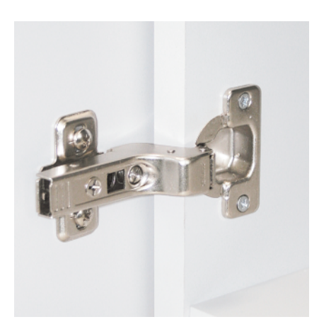
QUALITY COMPONENTS Cabinet doors are equipped with high quality adjustable metal hinges.