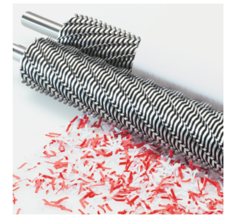
SOLID STEEL CUTTING SHAFTS High grade, hardened steel cutting shafts are milled in our Balingen factory and warranted for life.