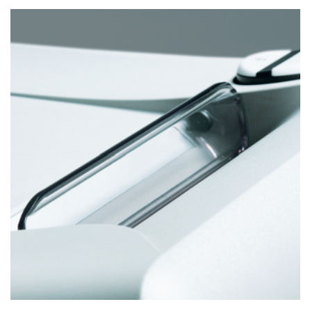
PATENTED SAFETY SHIELD Electronically controlled, transparent safety shield keeps fingers out of the feed opening.