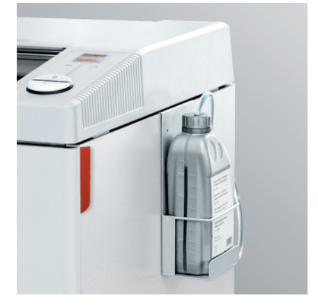
AUTOMATIC OIL INJECTION

Patented Electronic Capacity Control (ECC) indicator monitors sheet capacity levels during operation to prevent jams.