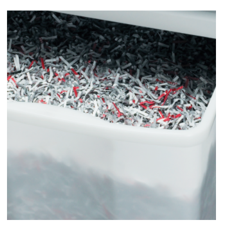
ENVIRONMENTALLY FRIENDLY BIN

An electronically controlled, transparent safety shield protects the operator from stray splinters of plastic.