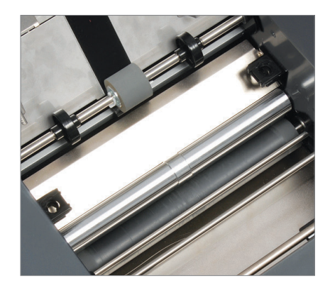
ANGLED SEAL TECHNOLOGY Innovative and exclusive angled seal technology provides superior sealing capabilities.