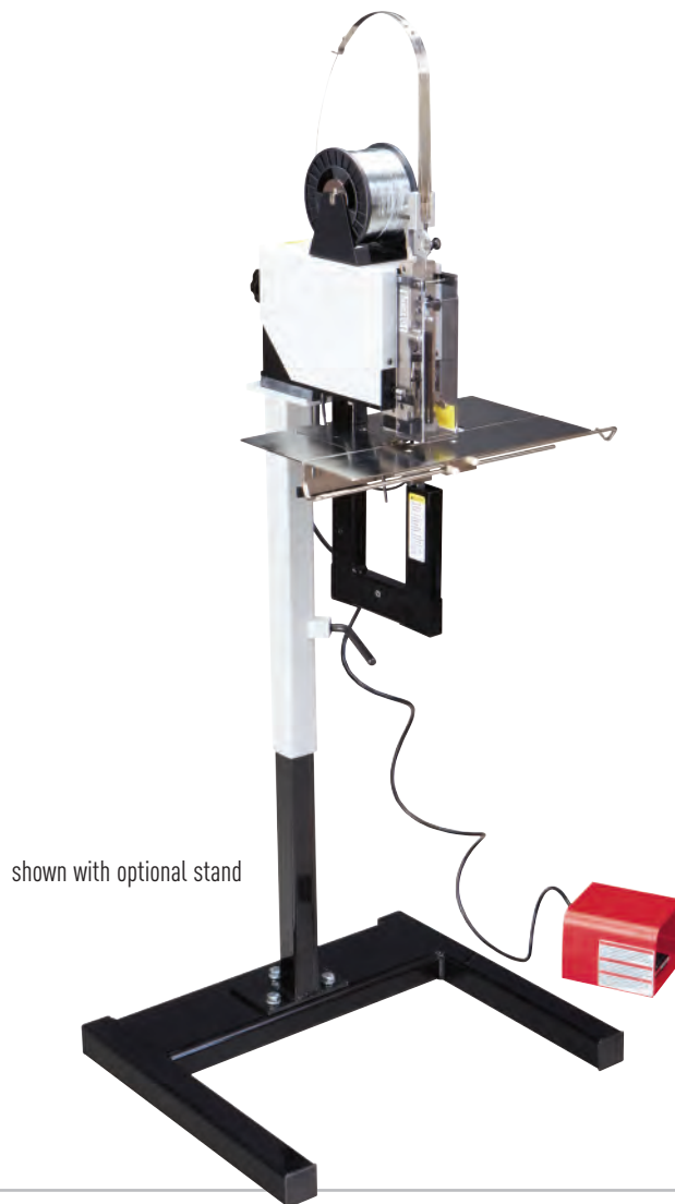
shown with optional stand

Dimensions (D x W x H): 15 x 16 x 24 inches, Shipping weight: 50 lbs.