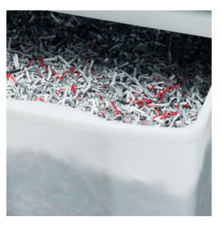
ENVIRONMENTALLY FRIENDLY BIN

On CD capable models, the electronically controlled shield protects the operator from stray splinters of plastic.