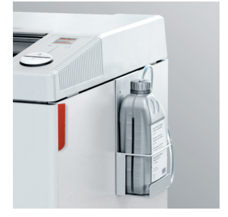
AUTOMATIC OIL INJECTION

Patented Electronic Capacity Control (ECC) indicator monitors sheet capacity levels during operation to prevent jams.