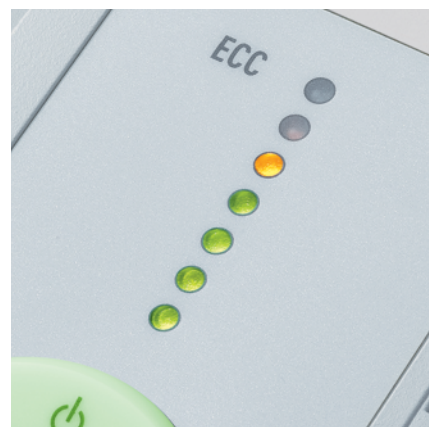
CAPACITY INDICATOR Patented Electronic Capacity Control (ECC) indicator monitors sheet capacity levels during operation to prevent jams.