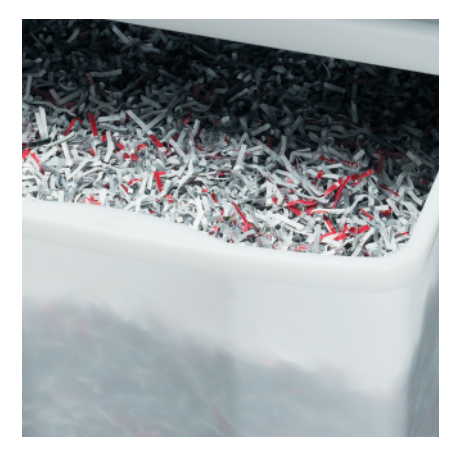
ENVIRONMENTALLY FRIENDLY BIN Durable, lightweight shred bins can be used with or without disposable bags.