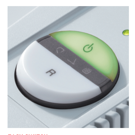
EASY SWITCH Multifunction control element uses optical signals to indicate operational status and functions as an emergency stop switch.