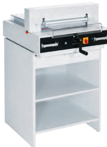
Shown with optional stand and cabinet