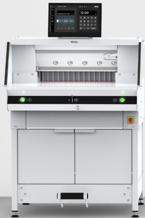
Shown with optional base frame panels.